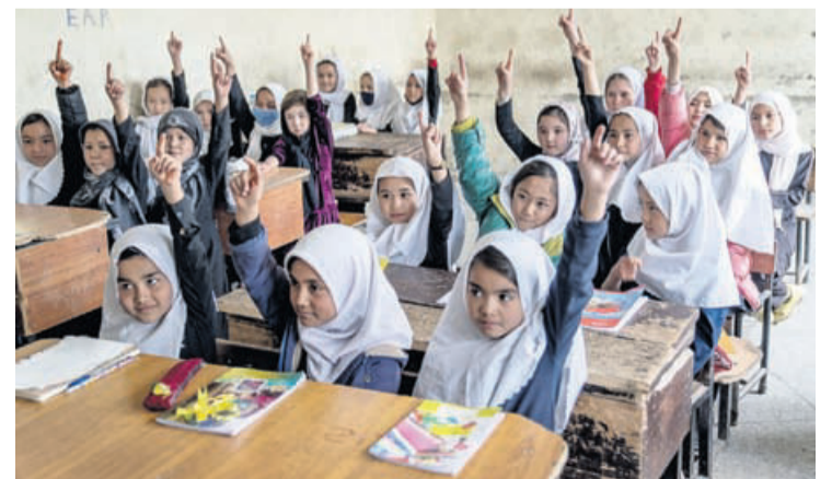
Afghan school girls attend their classroom on the first day of the new school year, in Kabul, Saturday, March 25, 2023.

there has been less attention to the deep harm inflicted on boys' education as qualified teachers including women left, and inclusion of regressive curriculum changes as well as an increase in corporal punishment have led to falling attendance. □